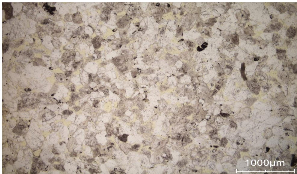
Figure 2: Detail view showing the general appearance of Neubrunn stone under a polarizing microscope (single polarized light). The intergranular pores are visible in yellow in the picture. Quartz grains (nonporous) appear white. Feldspar grains and rock fragments appear in light grey.

Figure 2 displays an optical microscopy image of the thin section from Neubrunn stone, highlighting the internal microstructural features responsible for moisture retention. The petrographic analysis under a polarizing microscope provides essential insights into the internal pore structure of the Neubrunn sandstone. The intergranular pores, visible in yellow, are the primary contributors to the stone's effective porosity. These pores are critical for moisture retention and movement within the stone. Additionally, the analysis reveals a second category of pores, intragranular pores, located within the grains themselves, such as feldspar and rock fragments. While these pores contribute to porosity, their role in moisture retention is limited compared to the intergranular pores. The distinction between these two types of pores is vital in understanding how moisture behaves in Neubrunn sandstone. The intergranular pores serve as the primary pathways for moisture movement, whereas the intragranular pores have a secondary influence on moisture distribution.