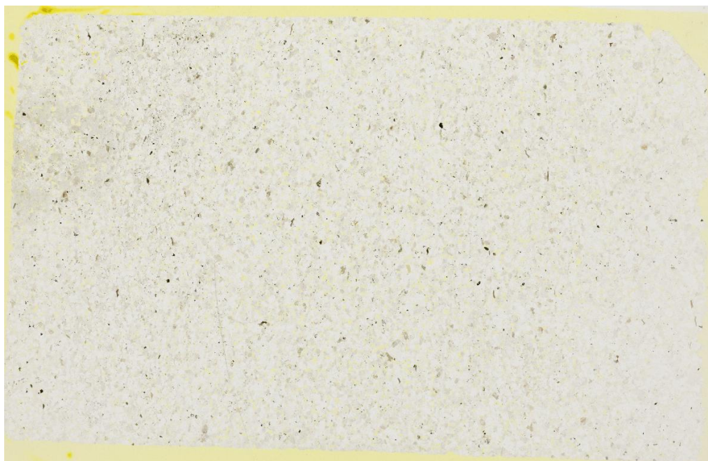
Figure 1: General view of the thin section of Neubrunn sandstone

In this work, we prepared a hyperspectral dataset from Neubrunn stone (German sandstone). This stone is part of a larger group of stones from the Upper Triassic, also known as Weisser Mainsandstein. The stone sample is a cube with dimensions of 6×6×6 \text{cm}^3 . Following the standard NBN EN 1936:2007 procedure, the sample was fully saturated (100%) under a vacuum for 48 hours to ensure homogeneous moisture distribution. After full saturation, the sample's MC was gradually reduced using an oven at 60°C, producing samples with different saturation levels (90%, 75%, 50%, and 25%), which were left wrapped in foil for 48 hours to equilibrate before capturing the hyperspectral image. In this work, we used a Snapscan SWIR hyperspectral camera manufactured by Imec to acquire hyperspectral images of the prepared samples. The Snapscan SWIR camera operates from 1100 to 1670 nm, capturing over 100 spectral bands with a spectral resolution of approximately 5 nm. The spatial resolution of the image is approximately 0.5 mm. In addition to the hyperspectral dataset, a 30 \mu\text{m} thin section, as shown in Figure 1, was produced from this stone type, and a petrographic examination was performed to highlight the type of pores present.